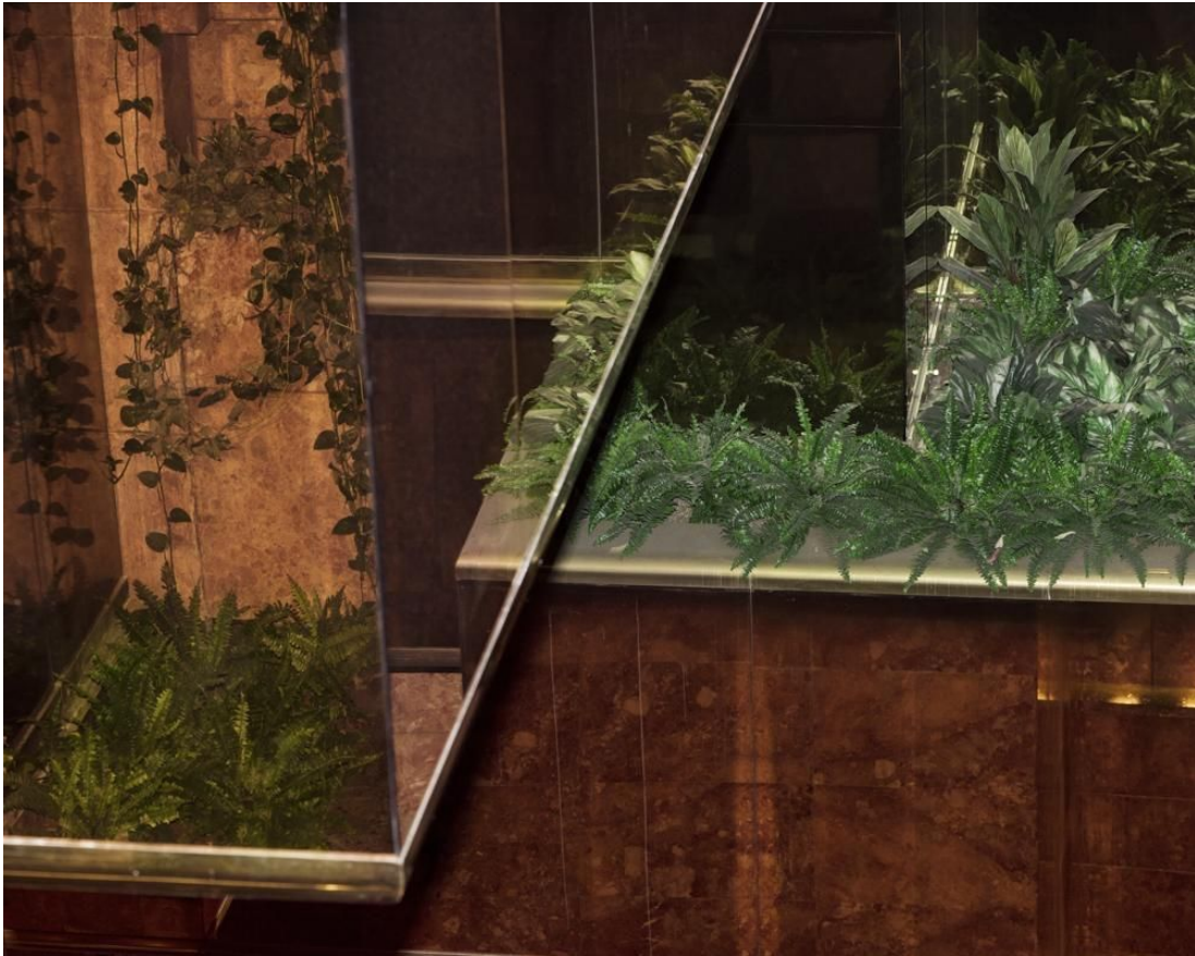
Res Trump Tower Interior n. 3 , 2017 11 in. x 17 in., archival pigment print ed. 3/5