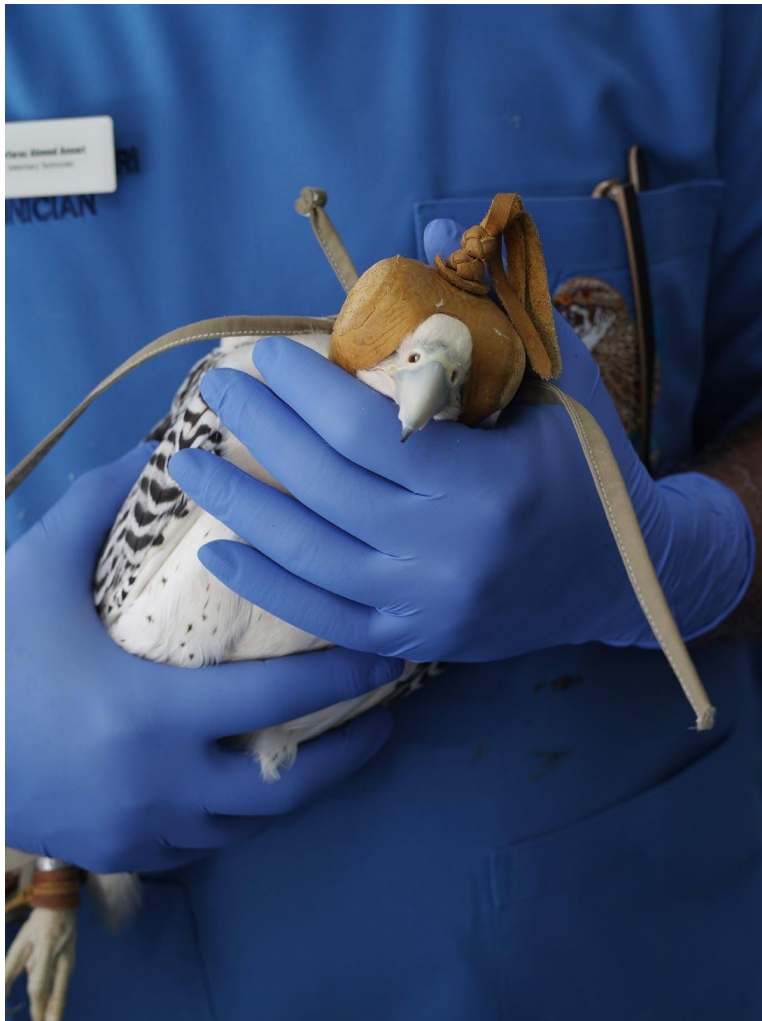
Farah Al Qasimi Falcon Hospital 3 (Glove and Uniform) , 2017 12 x 16 inches, pigment print ed. 3/5