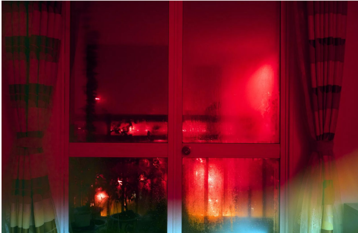
Chau Tran In Bedroom After The War , 2016 8 x 10 inches, archival inkjet print ed. 3/5