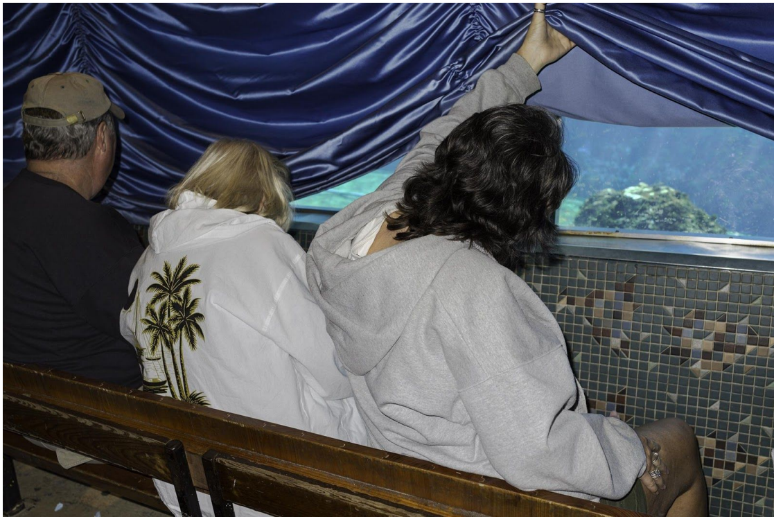
Harry Griffin Weeki Wachee , 2017 12 x 18 inches, pigment print ed. 3/5