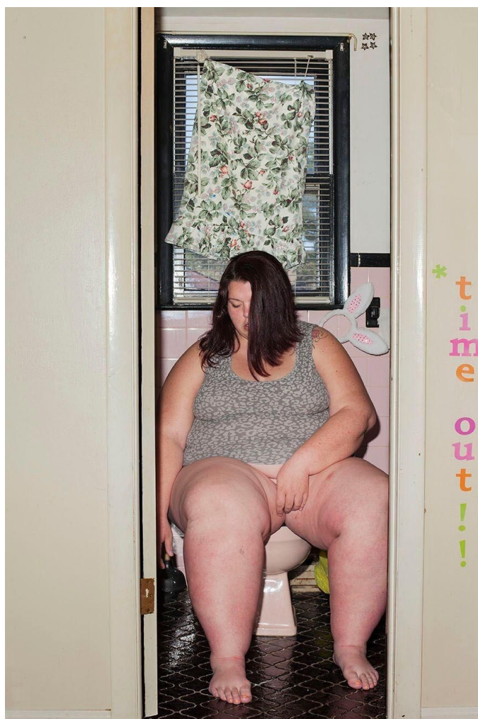
Danna Singer Timeout 8 x 12 inches, pigment print ed. 3/5