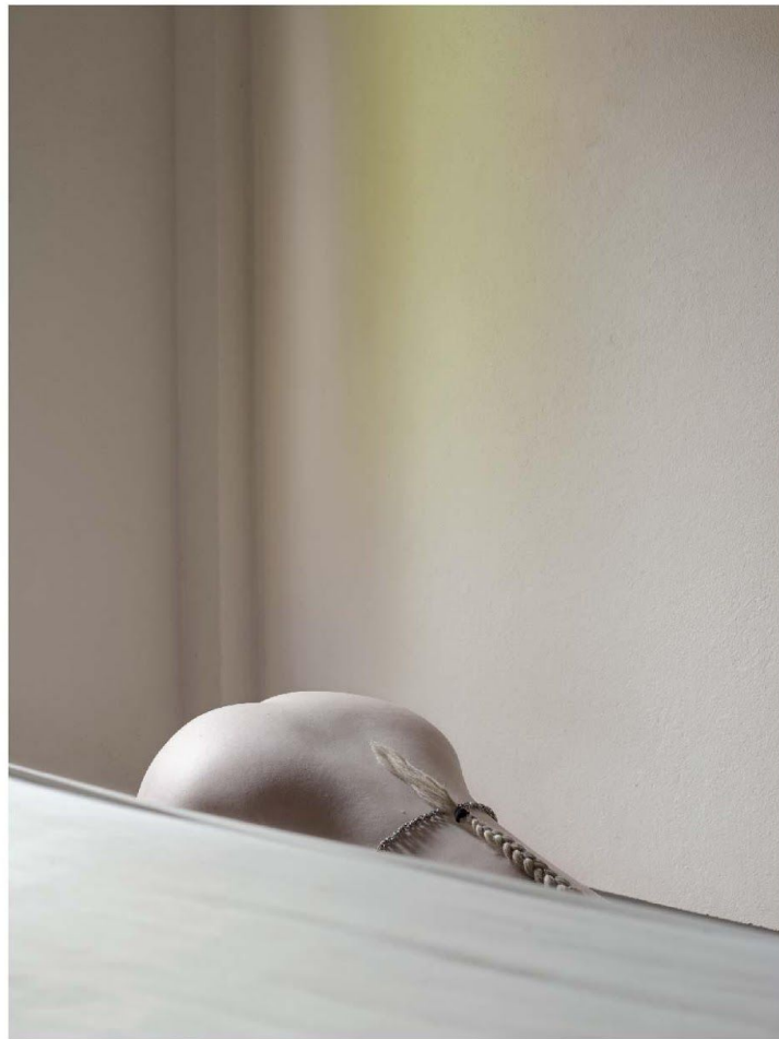
Anna Shimshak Untitled , 2016 11 x 14 inches, pigment print ed. 3/5