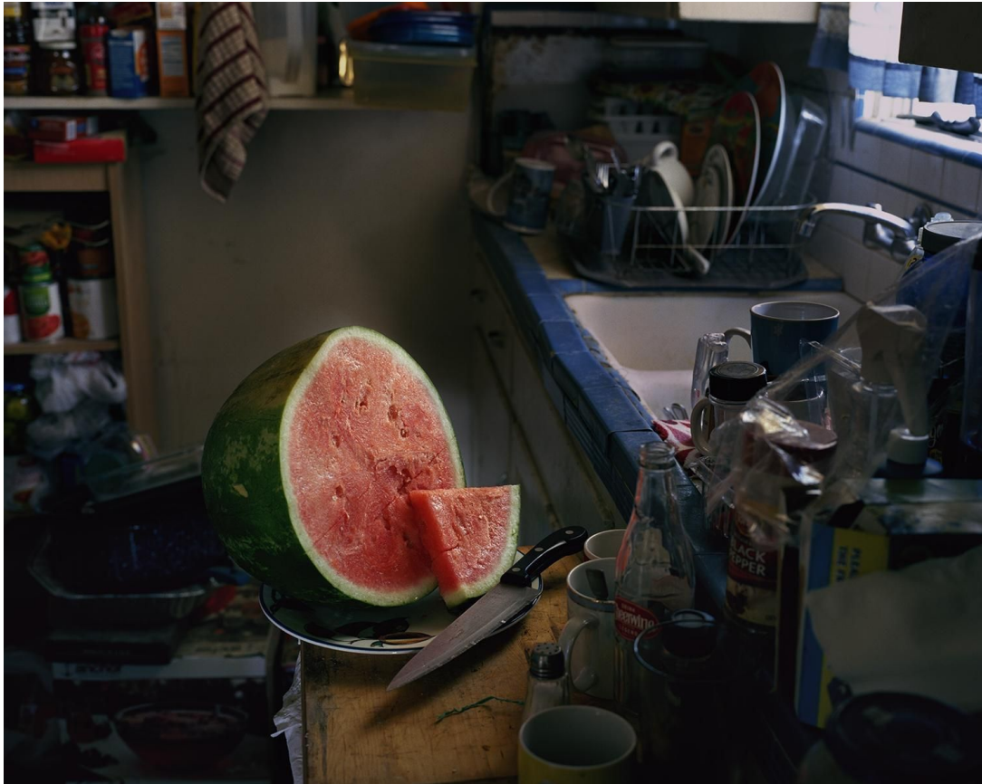
Lance Brewer Watermelon , 2015 12 in x 15 in, pigment print ed. 3/5